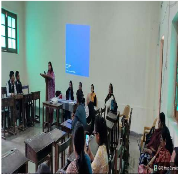
Kanpur, Uttar Pradesh, India 🇮🇳 F9c3+93j, Kali Mata Mandir Road, Khas Bazar, Shiwala, Patkapur, Kanpur, Uttar Pradesh 208001, India Lat 26.471217° Long 80.352711° Friday, 20/02/2026 11:32 AM GMT +05:30