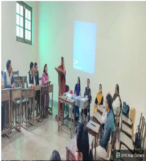
Kanpur, Uttar Pradesh, India 🇮🇳 F9c3+93j, Kali Mata Mandir Road, Khas Bazar, Shiwala, Patkapur, Kanpur, Uttar Pradesh 208001, India Lat 26.471201° Long 80.352698° Friday, 20/02/2026 11:34 AM GMT +05:30