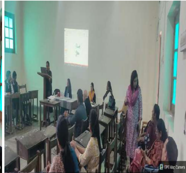
Kanpur, Uttar Pradesh, India 🇮🇳 F9c3+93j, Kali Mata Mandir Road, Khas Bazar, Shiwala, Patkapur, Kanpur, Uttar Pradesh 208001, India Lat 26.471213° Long 80.352734° Friday, 20/02/2026 11:28 AM GMT +05:30