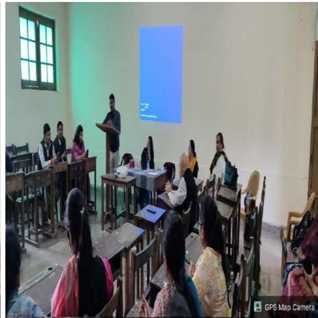
Kanpur, Uttar Pradesh, India 🇮🇳 F9c3+93j, Kali Mata Mandir Road, Khas Bazar, Shiwala, Patkapur, Kanpur, Uttar Pradesh 208001, India Lat 26.4712° Long 80.352715° Friday, 20/02/2026 11:35 AM GMT +05:30